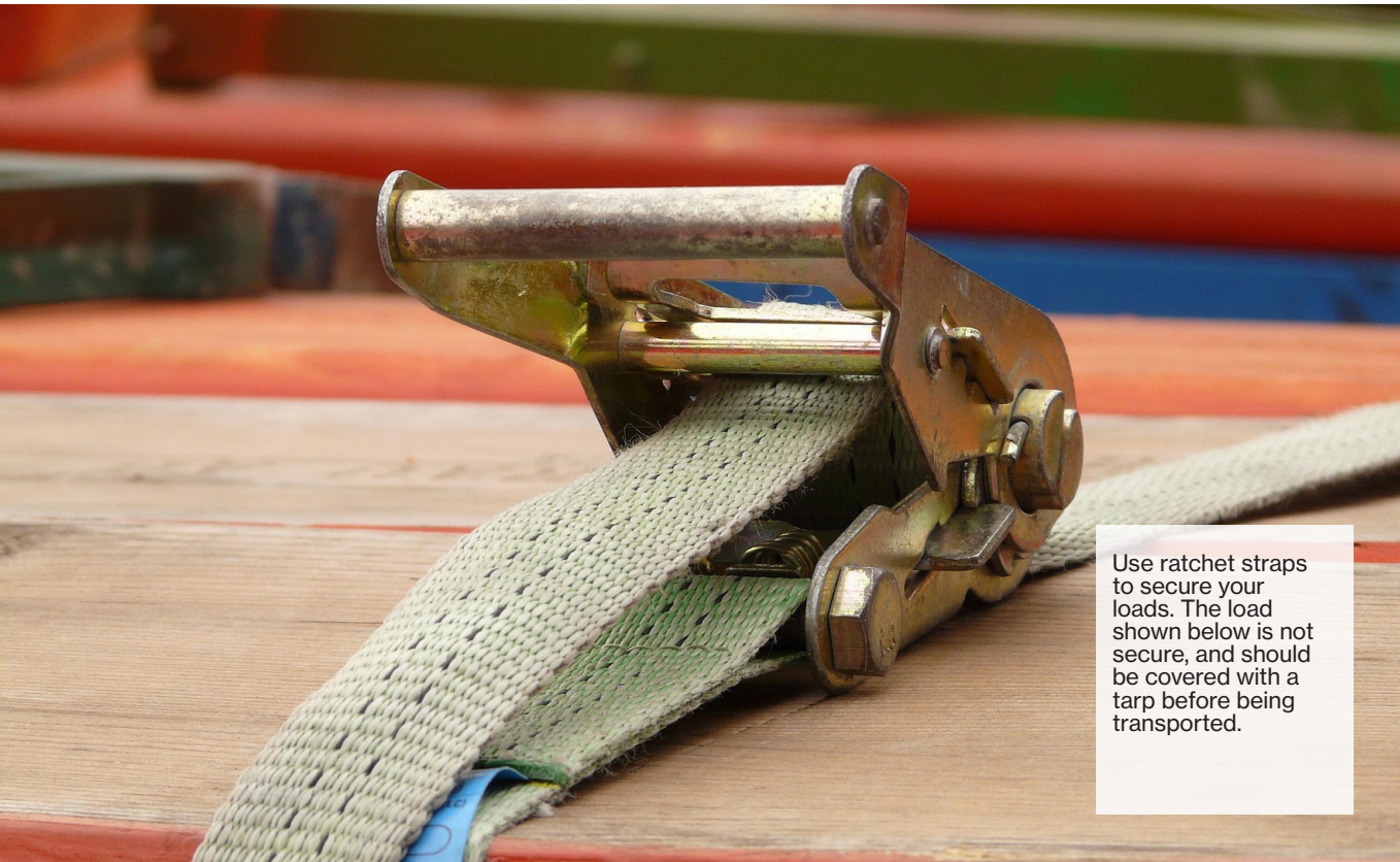
Use ratchet straps to secure your loads. The load shown below is not secure, and should be covered with a tarp before being transported.

Mother Nature has been slow on the delivery of spring weather this year, but that hasn't stopped people from getting a jump on their spring cleaning.