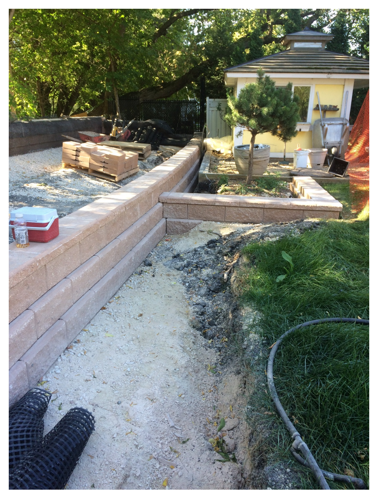
Photo 4 - Lower terrace segmental block wall placed on house side of the new dike and blocks placed around the tree at 1020 Highland Park Drive.