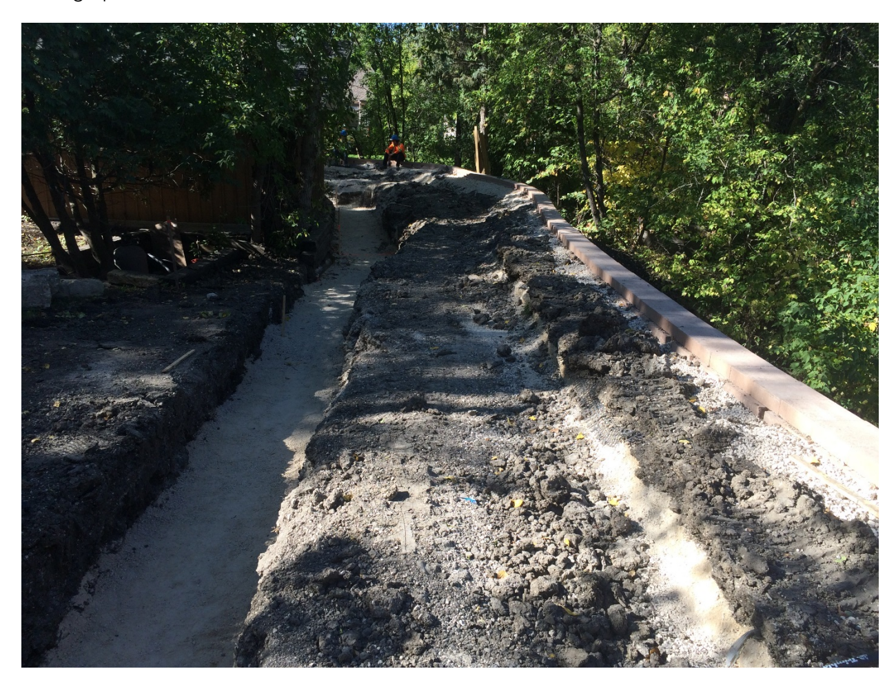
Photo 1 - Foundation for house side segmental block wall at 3144 Henderson Highway.