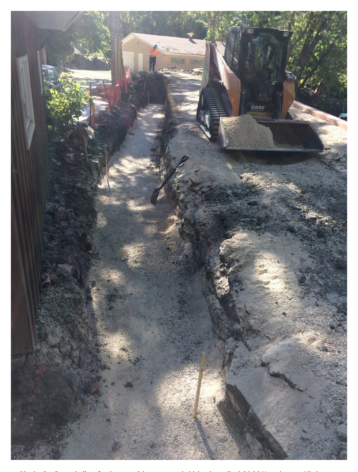
Photo 2 - Foundation for house side segmental block wall at 3144 Henderson Highway.