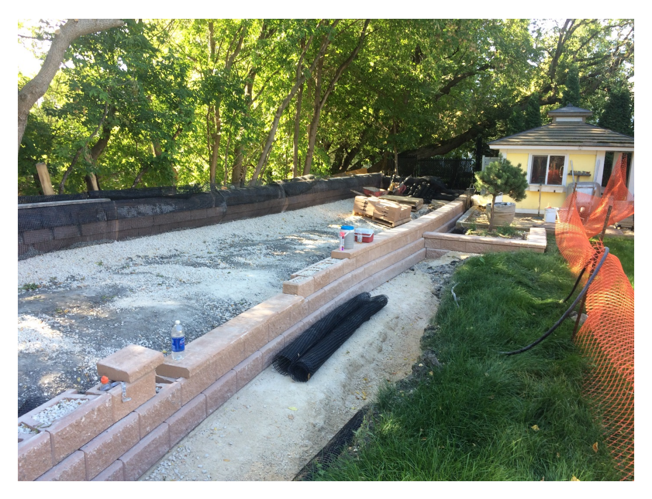
Photo 5 - Stair location on lower terrace segmental block wall at 1020 Highland Park Drive.