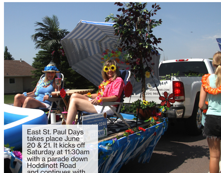
East St. Paul Days takes place June 20 & 21. It kicks off Saturday at 11:30am with a parade down Hoddinott Road and continues with activities at the Arena grounds until 10:30pm. Sunday's fun runs from 10am-2pm.