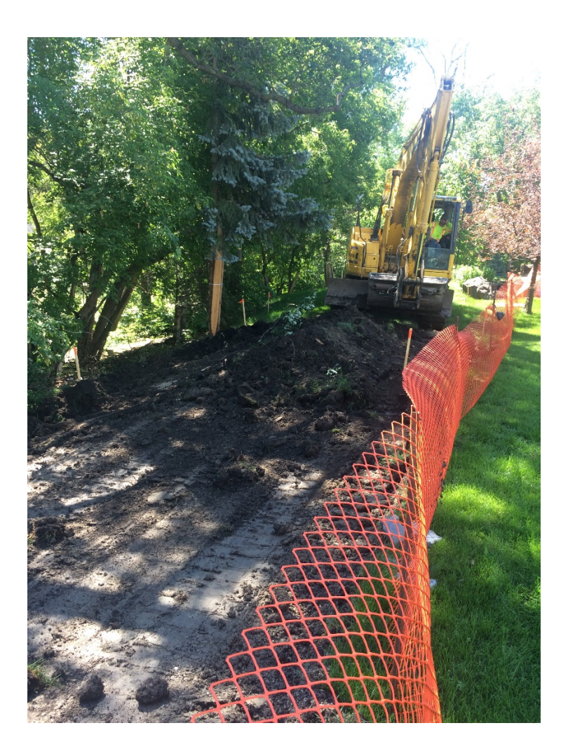
Photo 1 - Removal of the existing dike at 1030 Highland Park Drive.