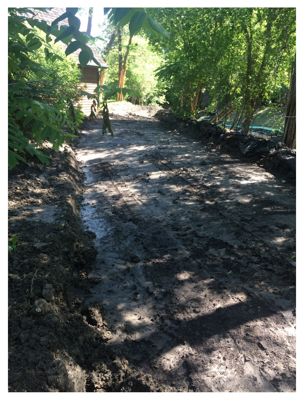
Photo 3 - Organic material removed below footprint of new dike at 1040 Highland Park Drive.