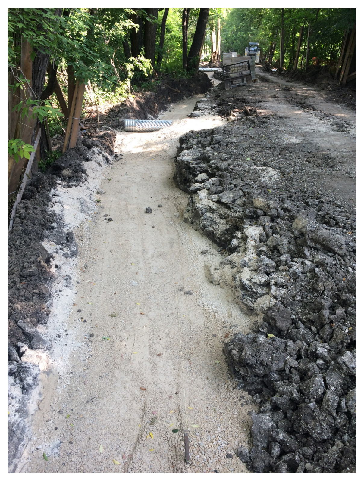
Photo 4 - Culvert installed at 3154 Henderson Highway and foundation for segmental block wall completed.