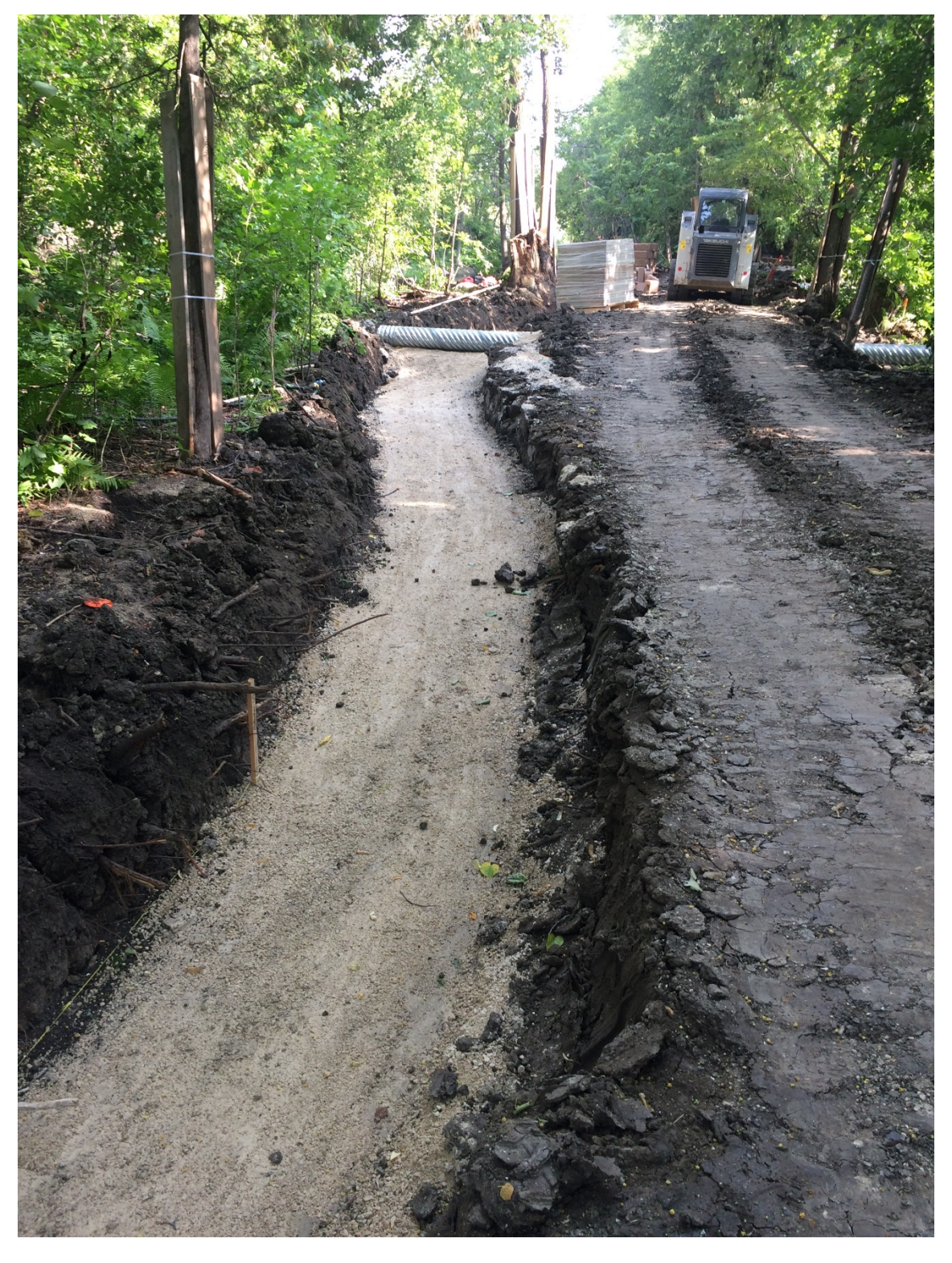
Photo 5 - Culvert installed at 3154 Henderson Highway and foundation for segmental block wall completed.