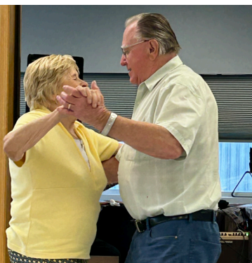
The AGM and Sock Hop/BBQ were well attended, and the Highway 6 Band had the crowd up and dancing.