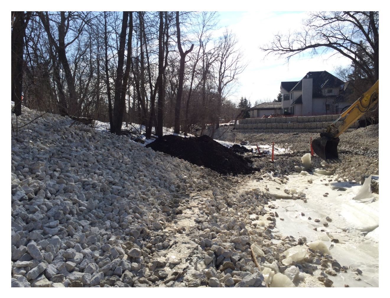
Photo 6 - Topsoil starting to get hauled to 3154 Henderson Highway.