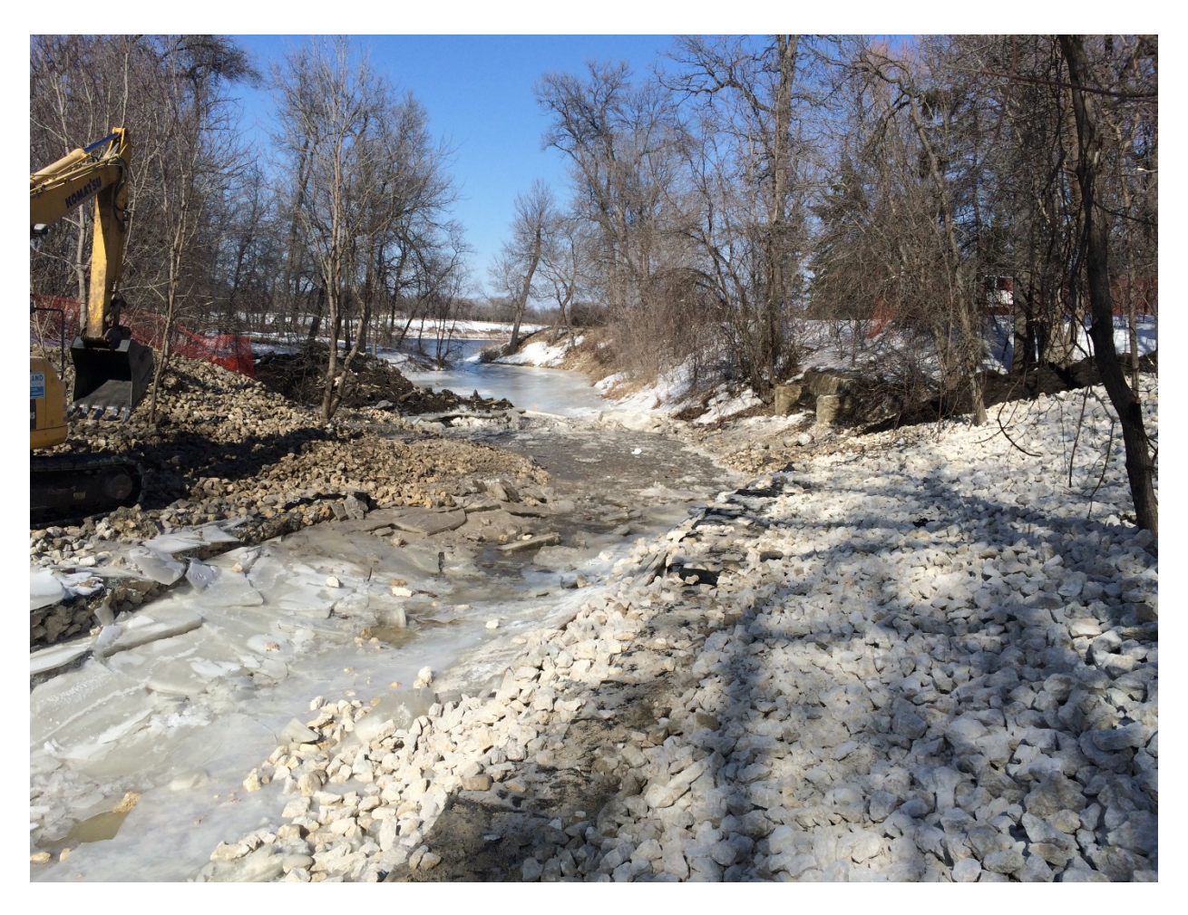
Photo 4 - Cofferdam removed between 1040 Highland Park Drive and 3154 Henderson Highway.