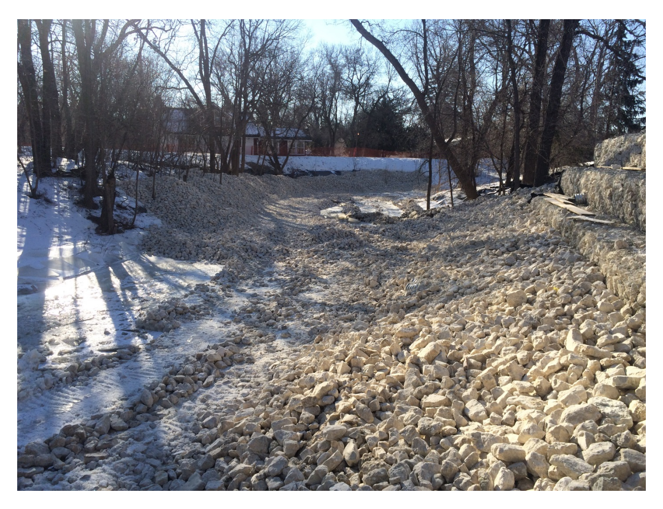
Photo 2 - Shaped rockfill toe berm at 1030 Highland Park Drive and placed rockfill at 3144 Henderson Highway.