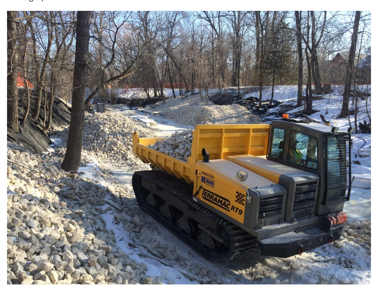
Photo 1 - Hauling rockfill for toe berm at 1040 Highland Park Drive.