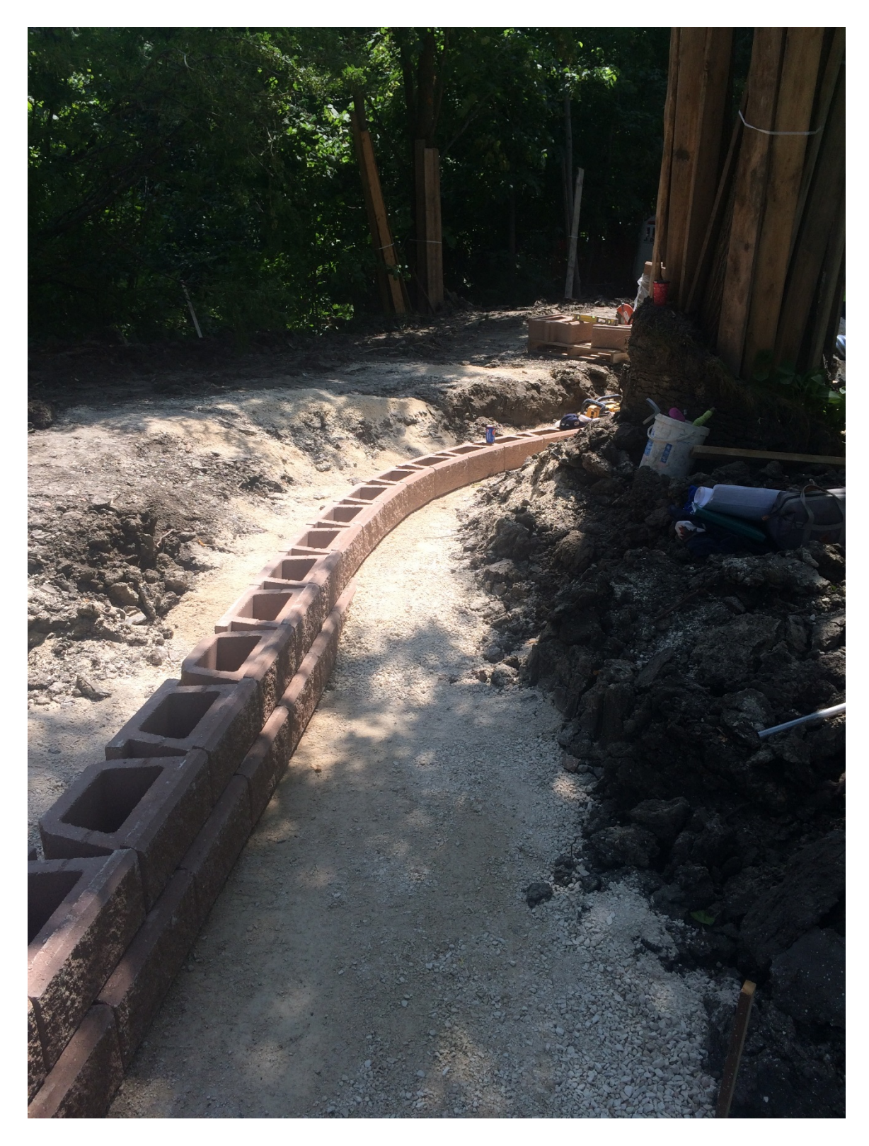
Photo 8 - Placement of the segmental block wall at 3154 Henderson Highway.