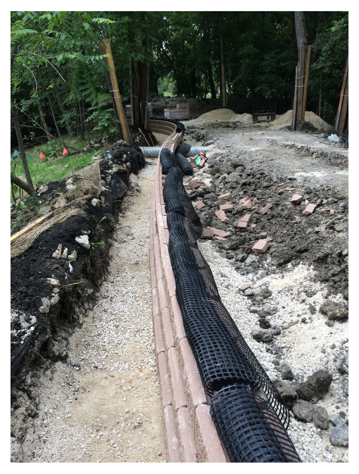
Photo 11 - Placement of the segmental block wall at 3154 Henderson Highway.