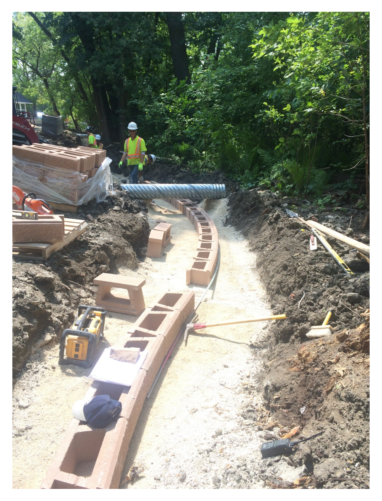
Photo 9 - Placement of the segmental block wall at 3154 Henderson Highway.