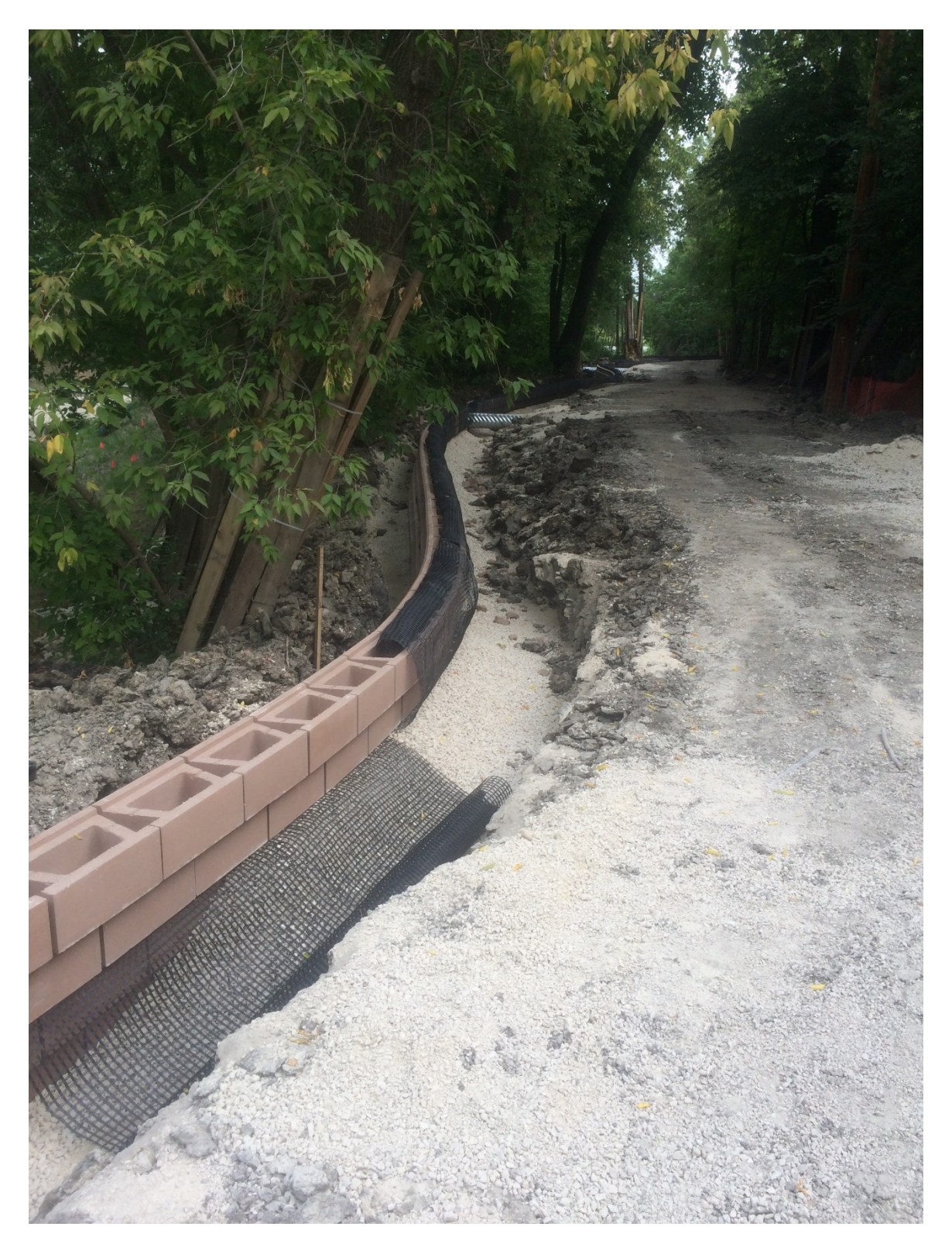
Photo 13 - Placement of the segmental block wall at 3144 and 3154 Henderson Highway.