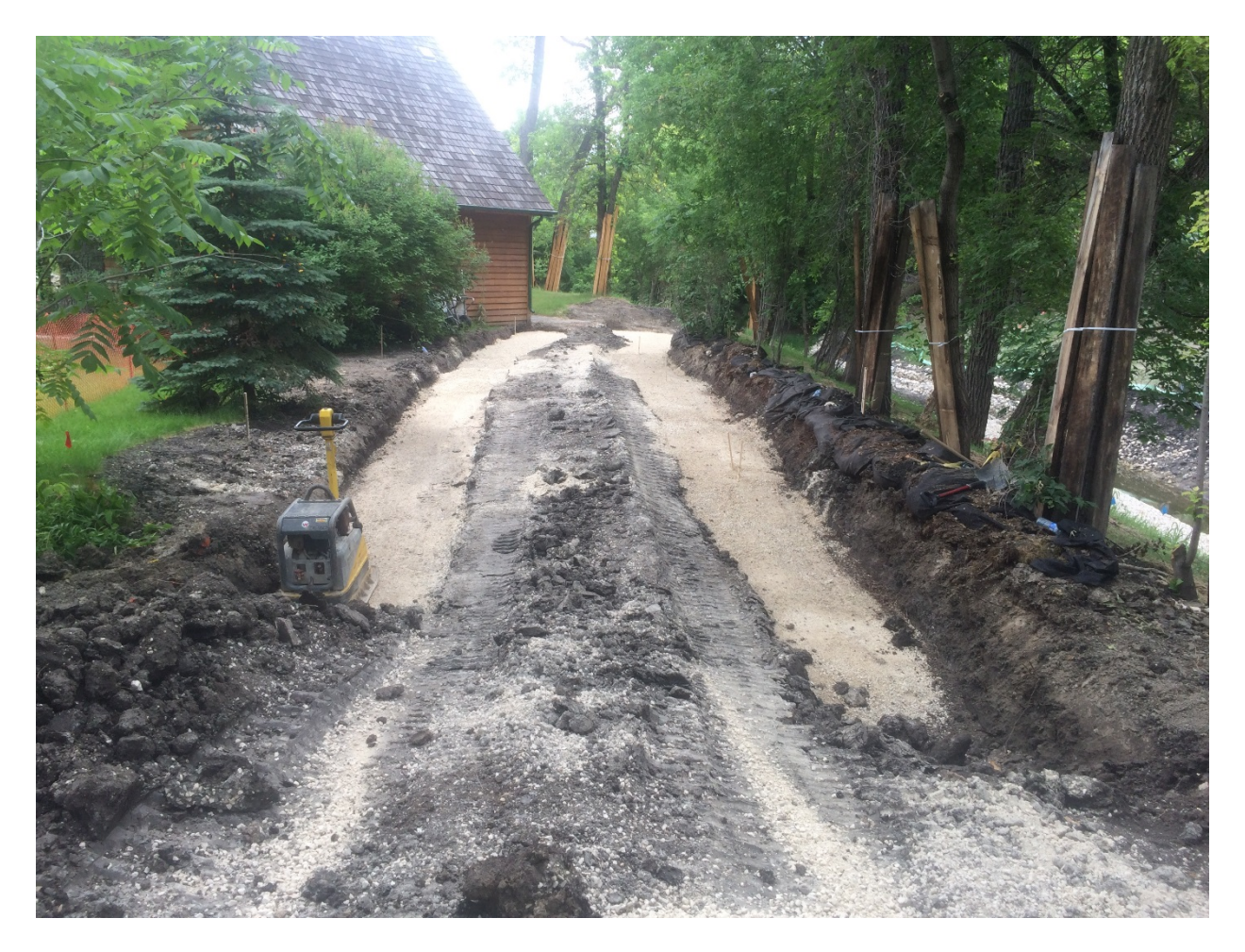
Photo 15 - Foundation for segmental block walls filled with gravel at 1040 Highland Park Drive.