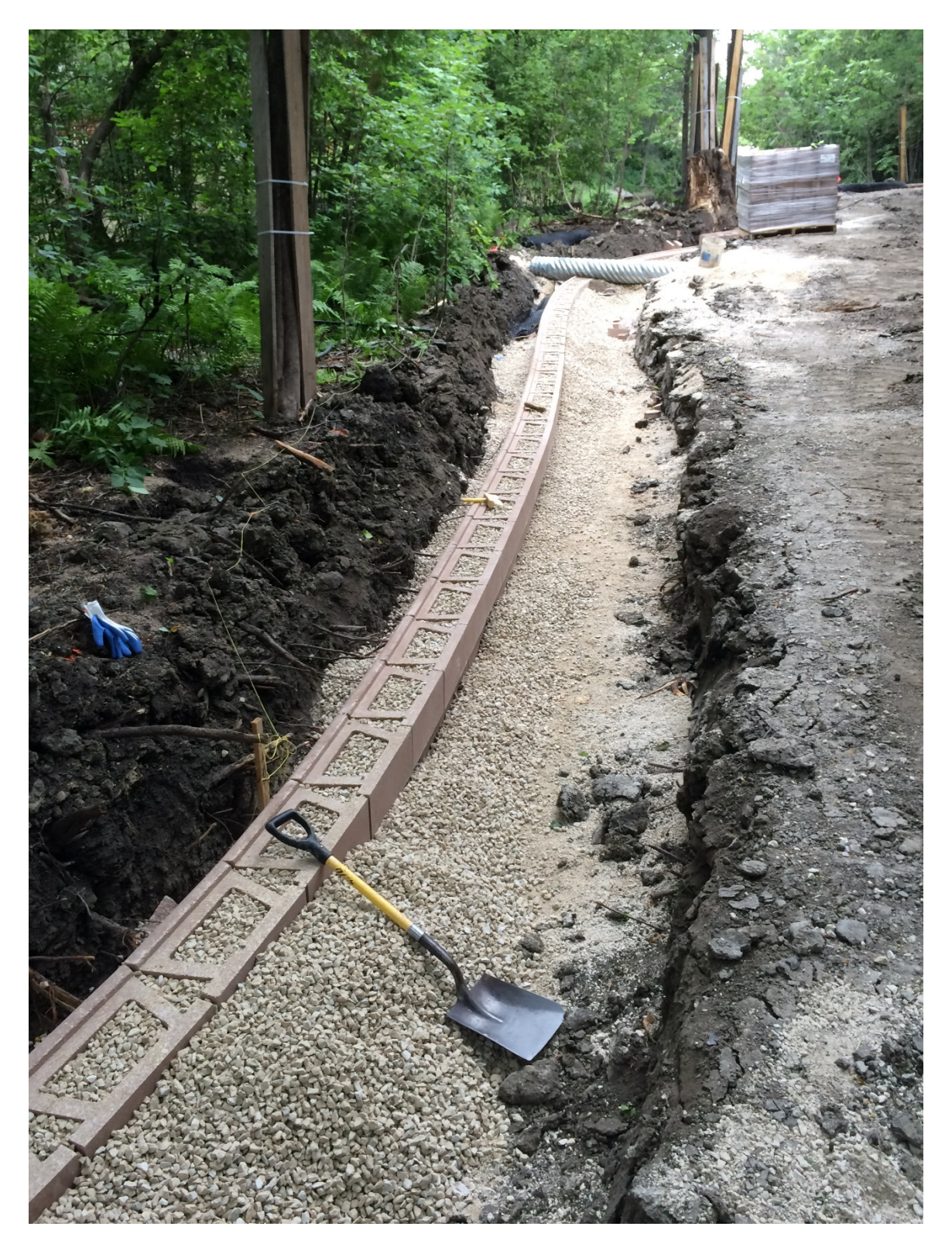
Photo 12 - Placement of the segmental block wall at 3154 Henderson Highway.