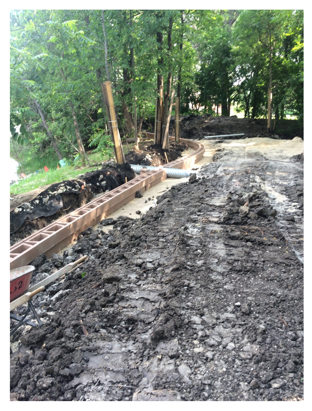
Photo 7 - Placement of the segmental block wall at 3154 Henderson Highway.