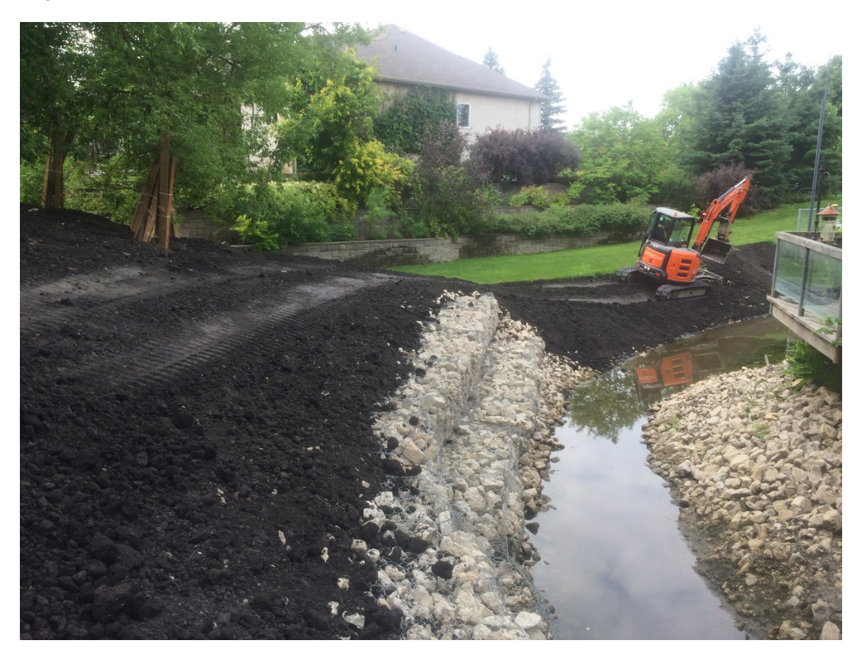
Photo 1 - Topsoil placement on the rockfill toe berm at 3144 Henderson Highway.