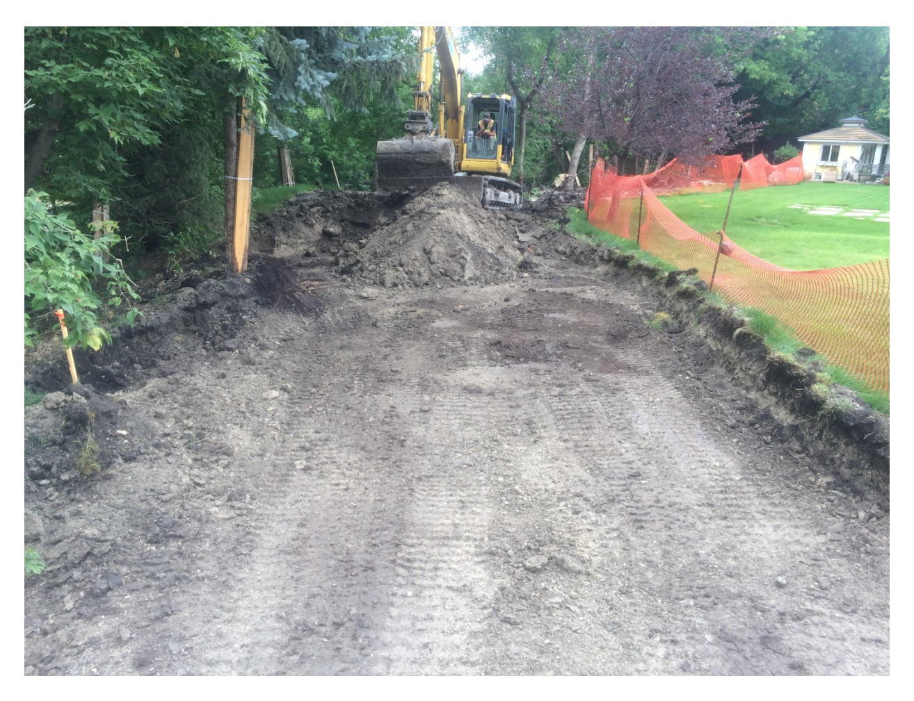
Photo 2 - Removal of organic material below footprint of new dike at 1030 Highland Park Drive.