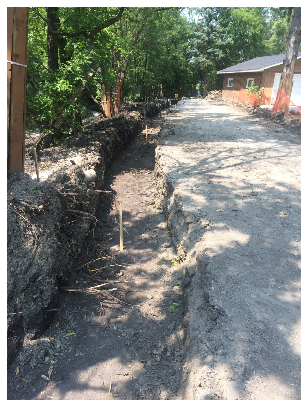
Photo 4 - Foundation for creek side segmental block wall excavated at 3144 Henderson Highway.