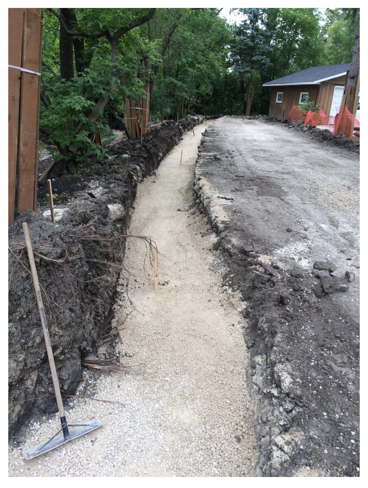
Photo 5 - Foundation for creek side segmental block wall filled with gravel at 3144 Henderson Highway.