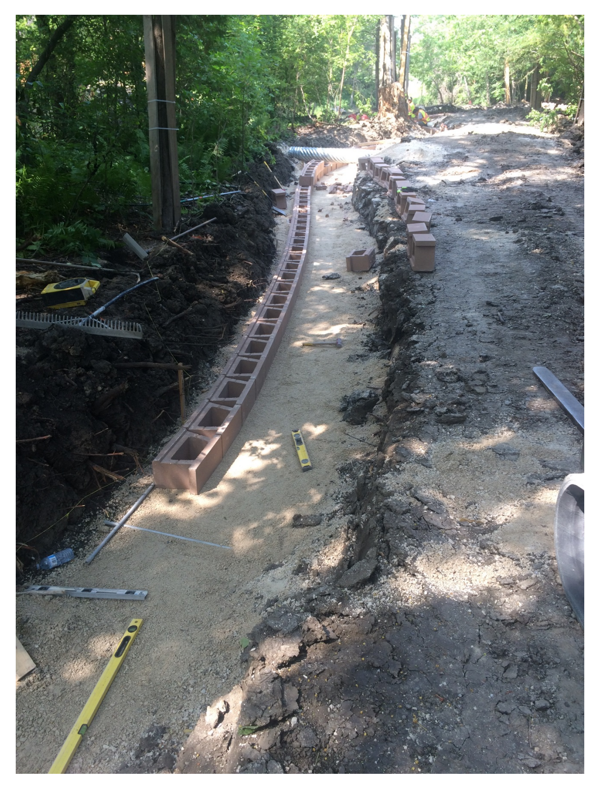
Photo 10 - Placement of the segmental block wall at 3154 Henderson Highway.