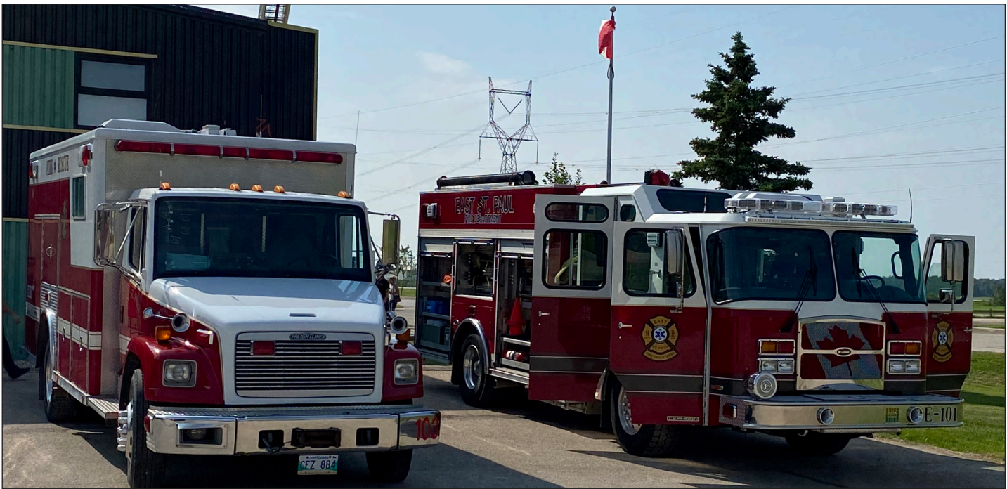
The East St. Paul Fire Department Open House is set for June 1 this year at the Fire Hall. Come out for fun and education!