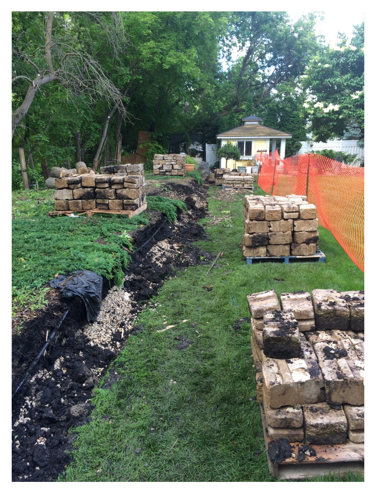
Photo 12 - Removal of the existing segmental block wall at 1020 Highland Park Drive.