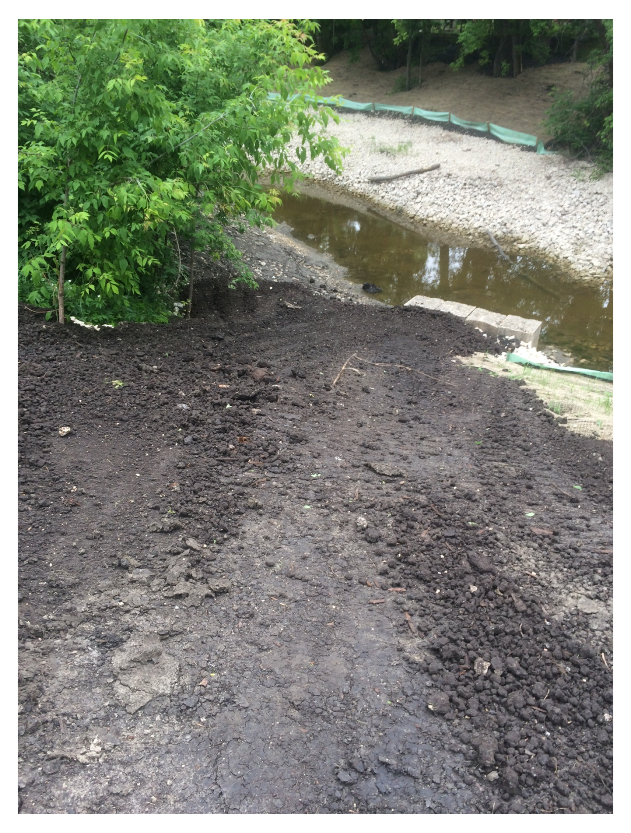
Photo 2 - Topsoil placed on rockfill toe berm at 3144 Henderson Highway.