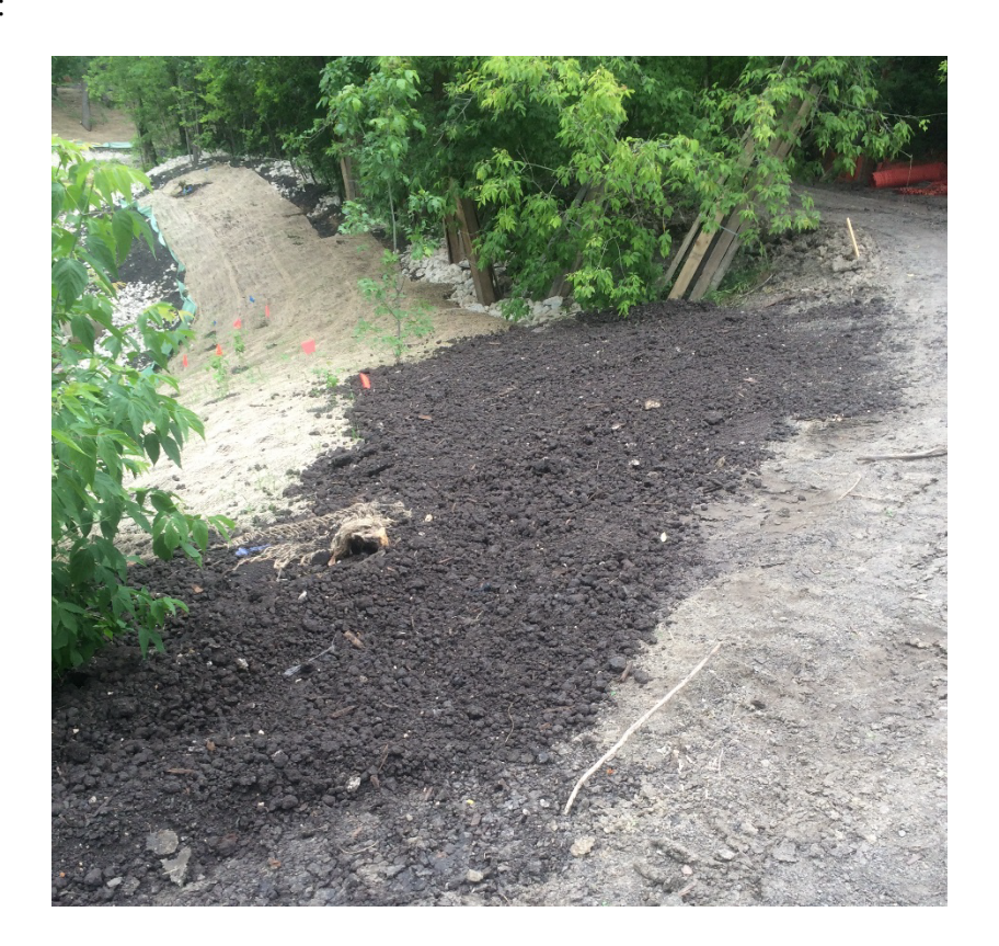
Photo 1 - Topsoil placed on rockfill toe berm at 3144 Henderson Highway.