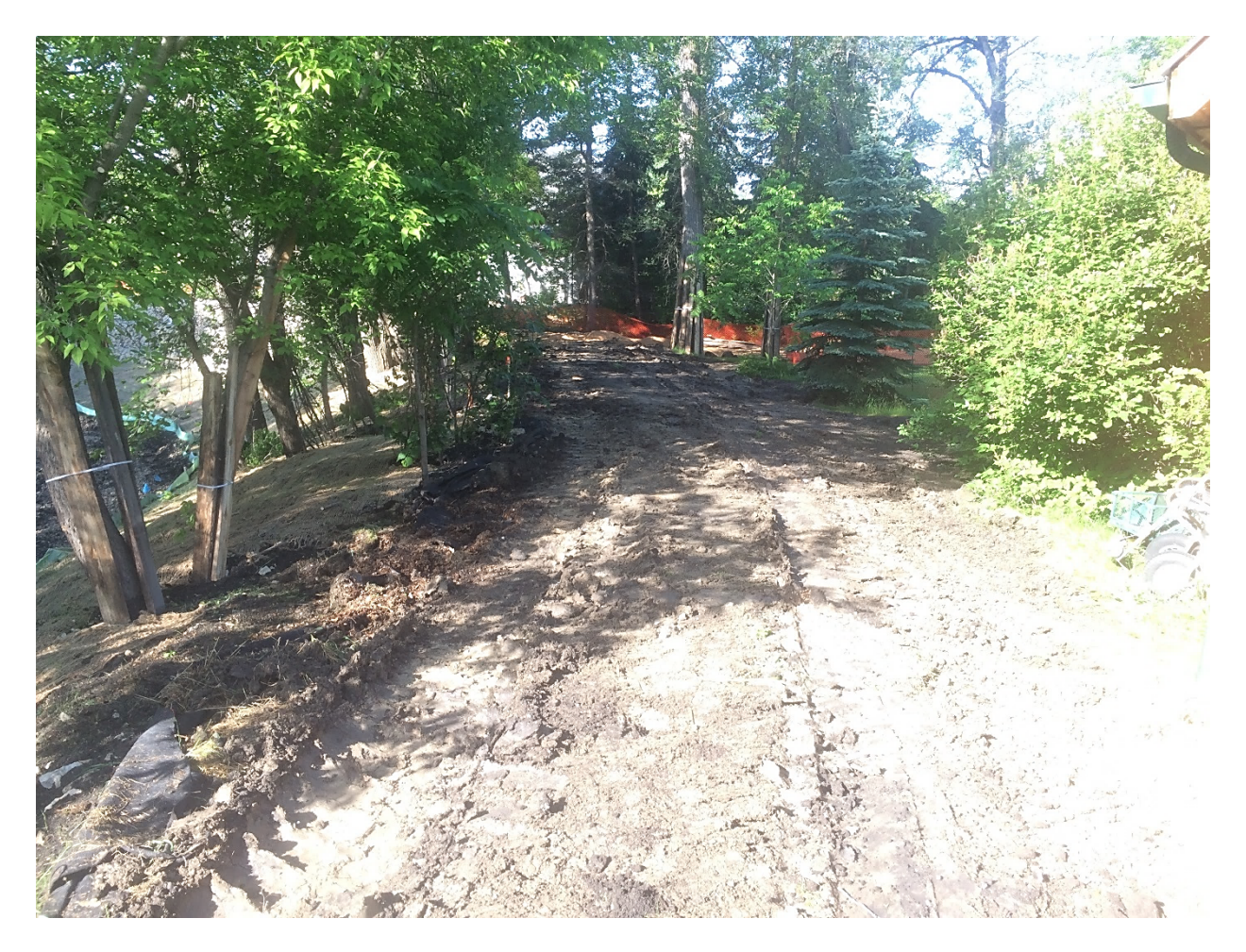
Photo 9 - Organic material removed from existing dike at 1040 Highland Park Drive.