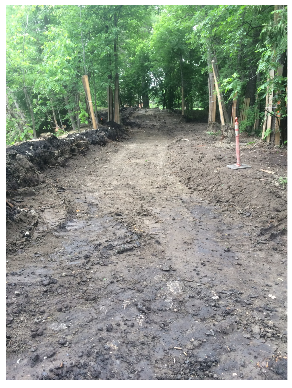
Photo 4 - Existing dike and organic material below existing dike removed at 3154 Henderson Highway.