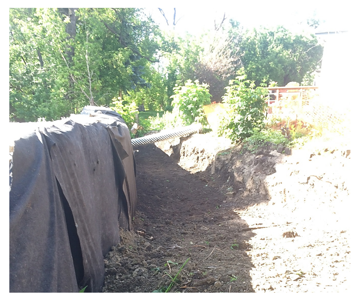
Photo 10 - Organic material removed and clay fill placed behind gabion baskets at 1030 Highland Park Drive.