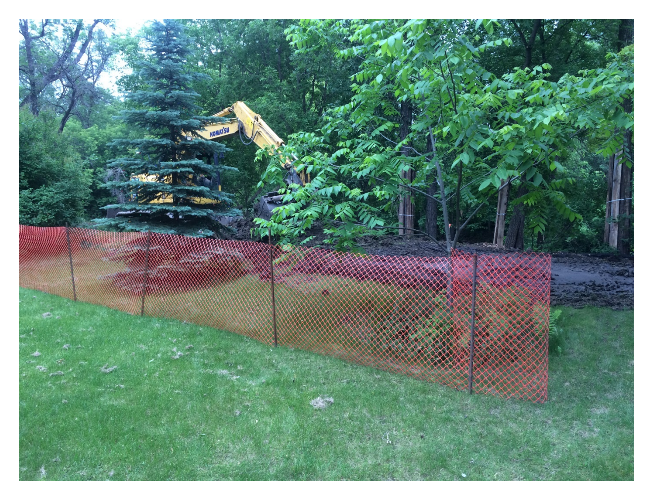
Photo 8 - Removal of organic material from existing dike at 1040 Highland Park Drive.