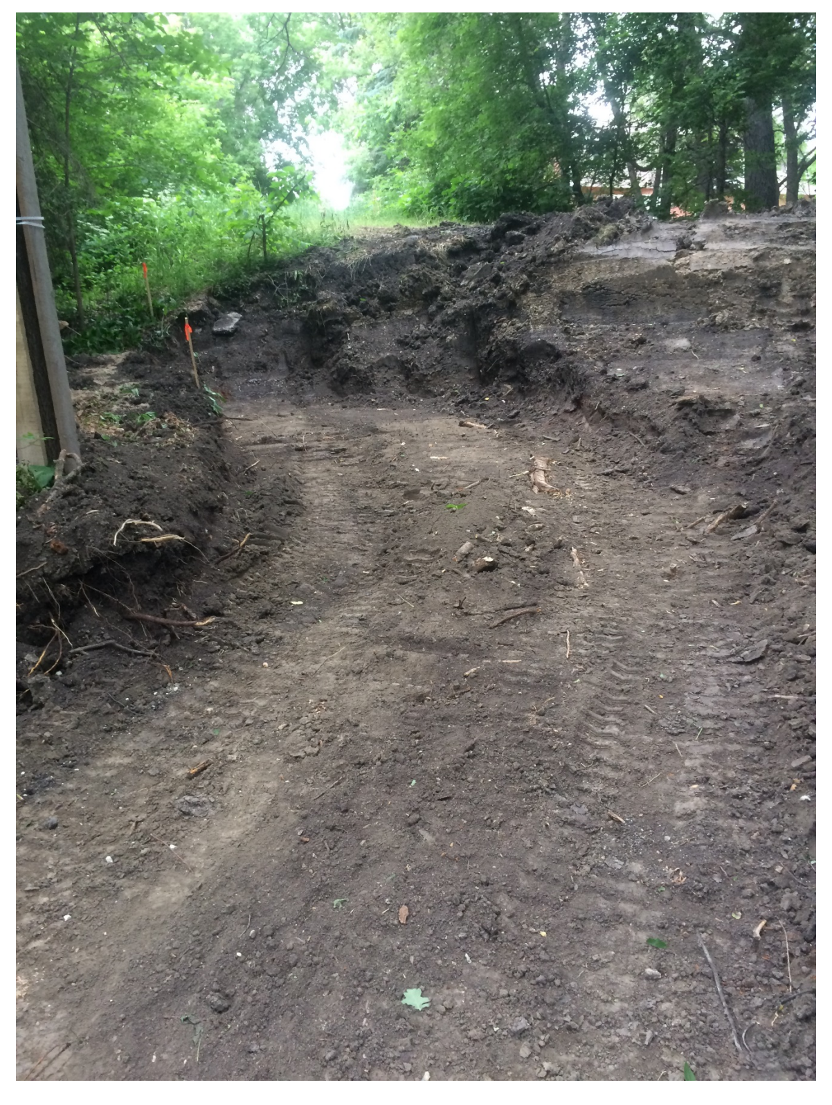
Photo 5 - Existing dike and organic material below existing dike removed at 3154 Henderson Highway.