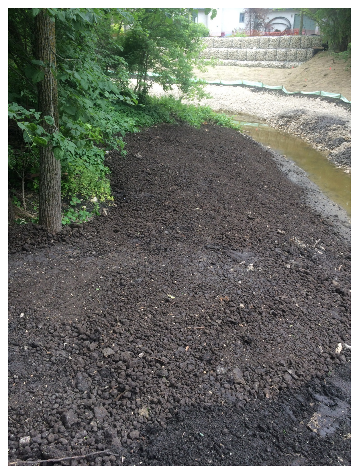
Photo 3 - Topsoil placed on rockfill toe and area required to remediate at 3154 Henderson Highway.